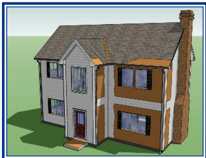
RESIDENTIAL - HEATING WRAP & SNOW MELTING