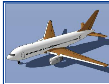
AVIATION - STABILIZER & WING DE-ICING

HEATED RUGS • HEATED MIRRORS HEATED WALL COVERINGS HEATED FLOORING REFRIGERATOR DEFROSTER HEATERS FOOD WARMERS • HEAT BLANKETS WATER PIPE NO-FREEZE HEAT TAPE DE-ICING DOOR MATS CLOSET DEHUMIDIFIER HEATERS ROOF DE-ICERS • DIVIDER HEATERS DESK MAT HEATERS SPACE HEATERS COFFEE MAKER HEATERS WALKWAY DE-ICER MATS LUNCH WARMER CONTAINERS & CABINETS