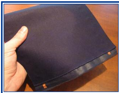
TEXTILES - CLOTHING & FABRIC PRODUCTS